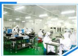
COG Automatic Plant