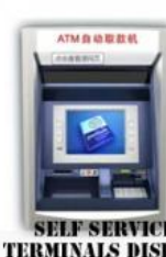
SELF SERVICE TERMINALS DISPLAY