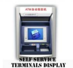
SELF SERVICE TERMINALS DISPLAY