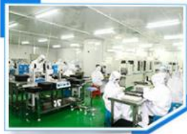
COG Automatic Plant