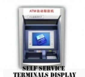
SELF SERVICE TERMINALS DISPLAY