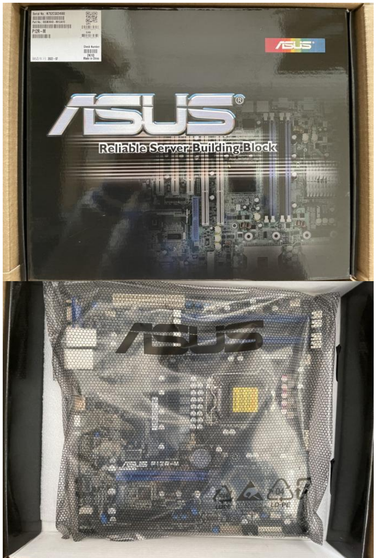
Packing & Delivery