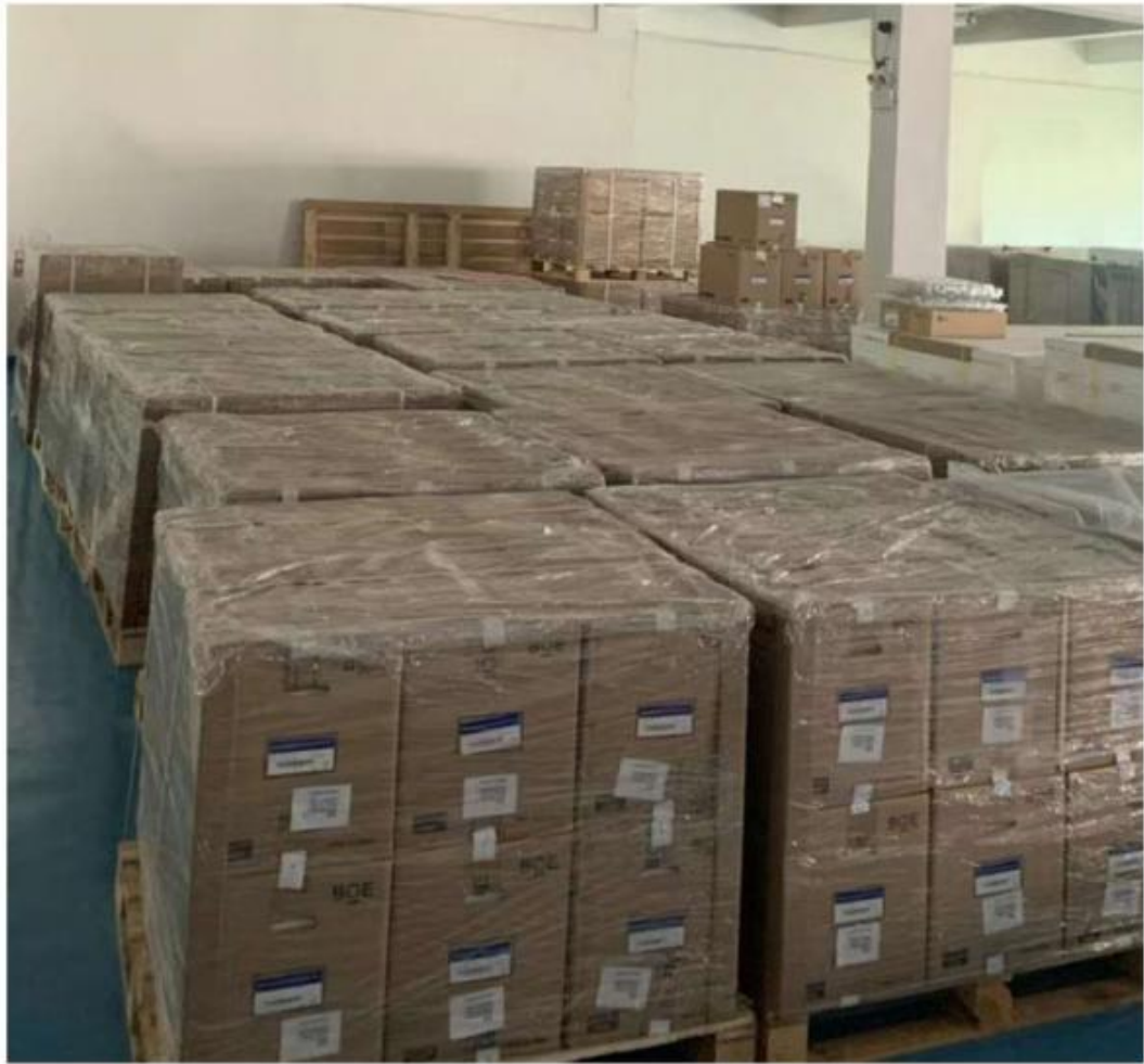
Packaging & Shipping