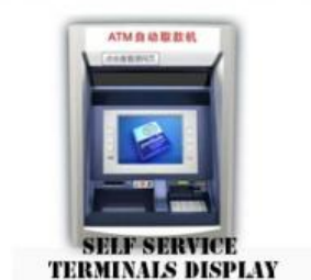
SELF SERVICE TERMINALS DISPLAY