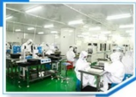
COG Automatic Plant