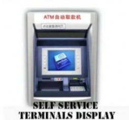
SELF-SERVICE TERMINALS DISPLAY