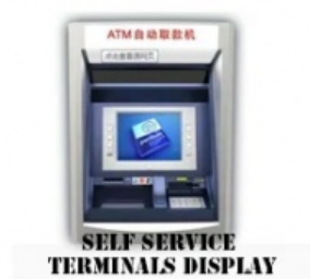
SELF SERVICE TERMINALS DISPLAY