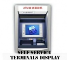
SELF SERVICE TERMINALS DISPLAY