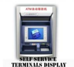
SELF SERVICE TERMINALS DISPLAY