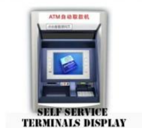
SELF SERVICE TERMINALS DISPLAY