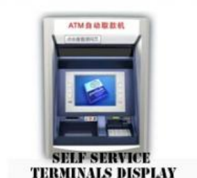
SELF SERVICE TERMINALS DISPLAY